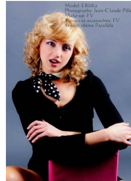
Model: ERIKA Make-up: FV Tenues et accessoires: FV Studio: 18ème Parallèle